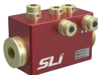
High Resolution FWS